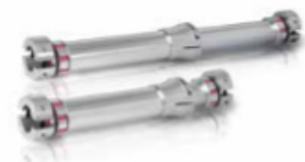
split clamping hub

Two split clamping hubs, with two clamping screws in each, and concave driving jaws. Backlash free, vibration damping, electrically isolating elastomer inserts press fit into the hubs. Precision intermediate tube with a high level of straightness and lateral stiffness. Outer tube clamps over inner tube to fix the overall length.